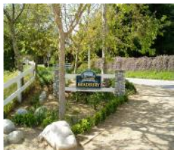
Welcome to Bradbury

The Bradbury City Council recently approved launching Nextdoor ( www.nextdoor.com ), the first private social network for neighborhoods, to foster neighbor-to-neighbor and citywide communication. Bradbury residents will be able to use Nextdoor to create private websites for their neighborhoods where they can get to know their neighbors, ask questions, obtain timely City updates and exchange local advice and recommendations.