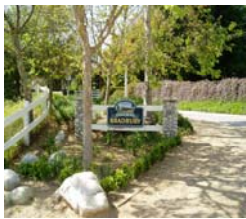
Welcome to Bradbury

Like all local governments, Bradbury faces numerous fiscal challenges. Why? It stems from a lack of leadership in Sacramento, State takeaways of local dollars and eroding local control to wielding State and Federal mandates that push the responsibility off of them and onto local cities, like Bradbury.